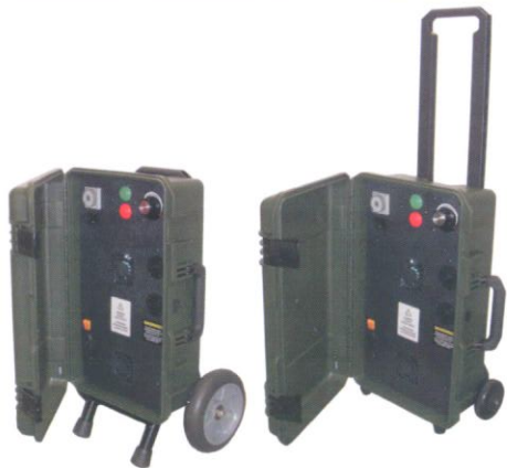
Model Number PEMF-100AT

Does your horse suffer from soreness in the back, from stiffness, arthritic conditions, hard work, ligament, tendon, muscle or bone injury, fractures, poor circulation or tie up?